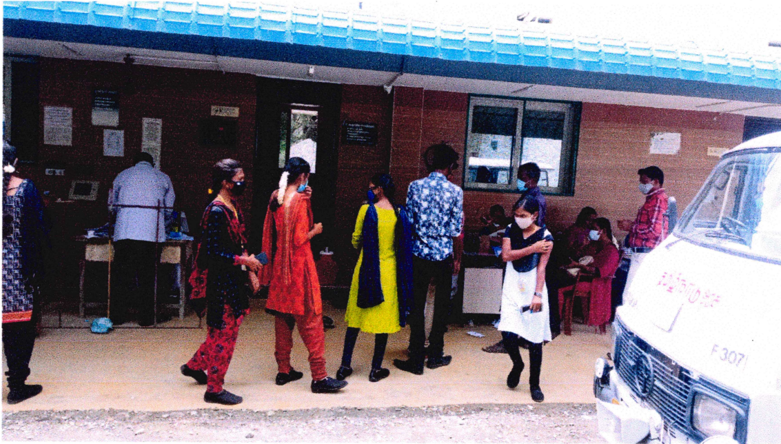
COVID 19 Vaccination Camp at T.N. Palayam on the date 24/06/2021