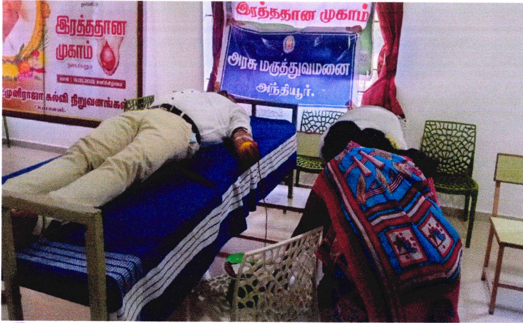
Blood Donation Camp at Athani on the date 02/03/2022