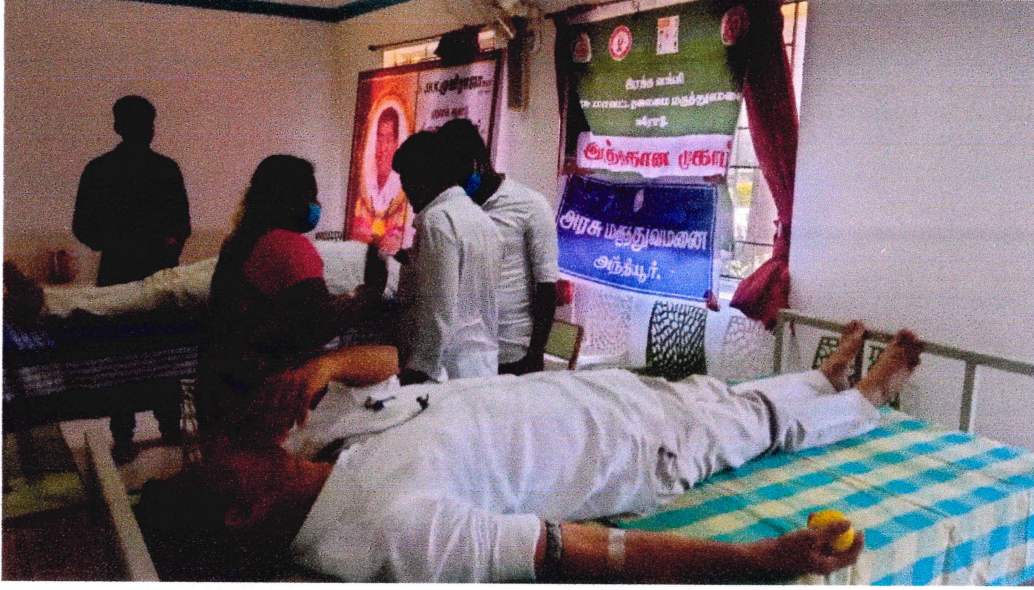
Blood Donation Camp at Athani on the date 02/03/2022