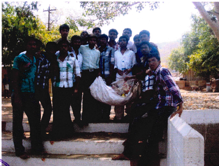
Swachh Bharat at Athani on the date 28/07/2021