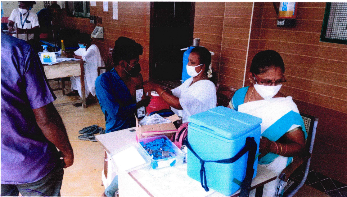
COVID 19 vaccination camp at T.N. Palayam on the date 24/06/2021