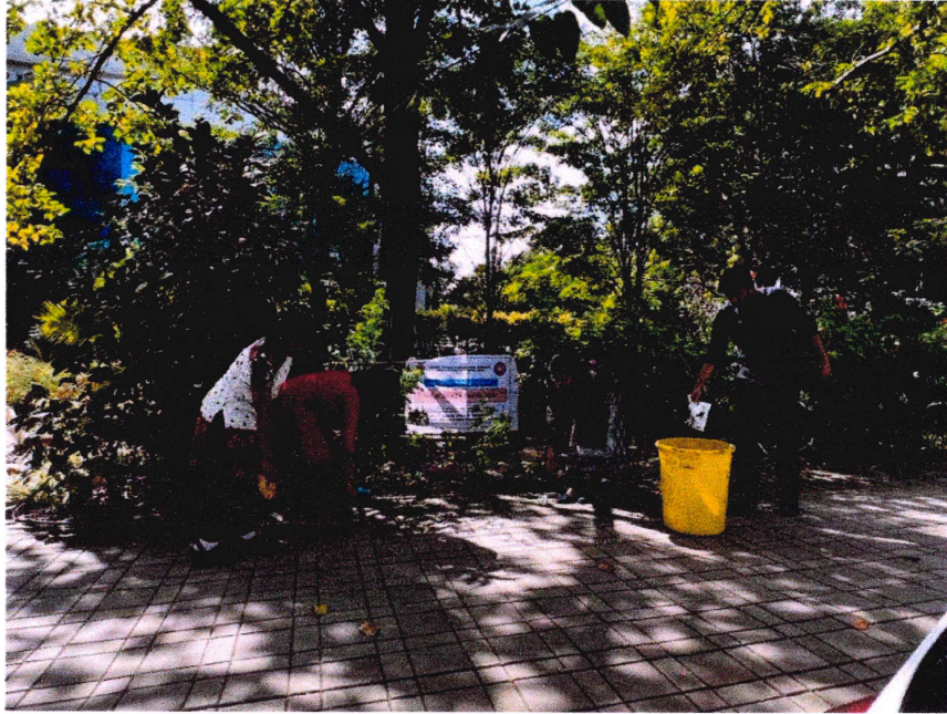
Swachh Bharat at Athani on the date 28/07/2021