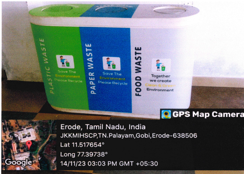
PHOTO OF DEGRADABLE AND NON-DEGRADABLE DUSTBIN

( Approved by Tamil Nadu Govt. & Pharmacy Council of India - New Delhi, Affiliated to The Tamil Nadu Dr. M.G.R Medical University, Chennai ) Thookanaickenpalayam, Gobichettipalayam (TK), Erode (DT) - 638506, Tamil Nadu.