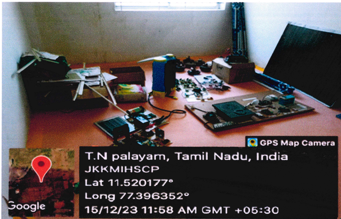
PHOTO OF ELECTRONIC WASTE

[Signature] Principal JKK Munirajah Institute of Health Sciences College of Pharmacy, T.N.Palayam, Gobi (Tk), Erode (Dt) - 638 506