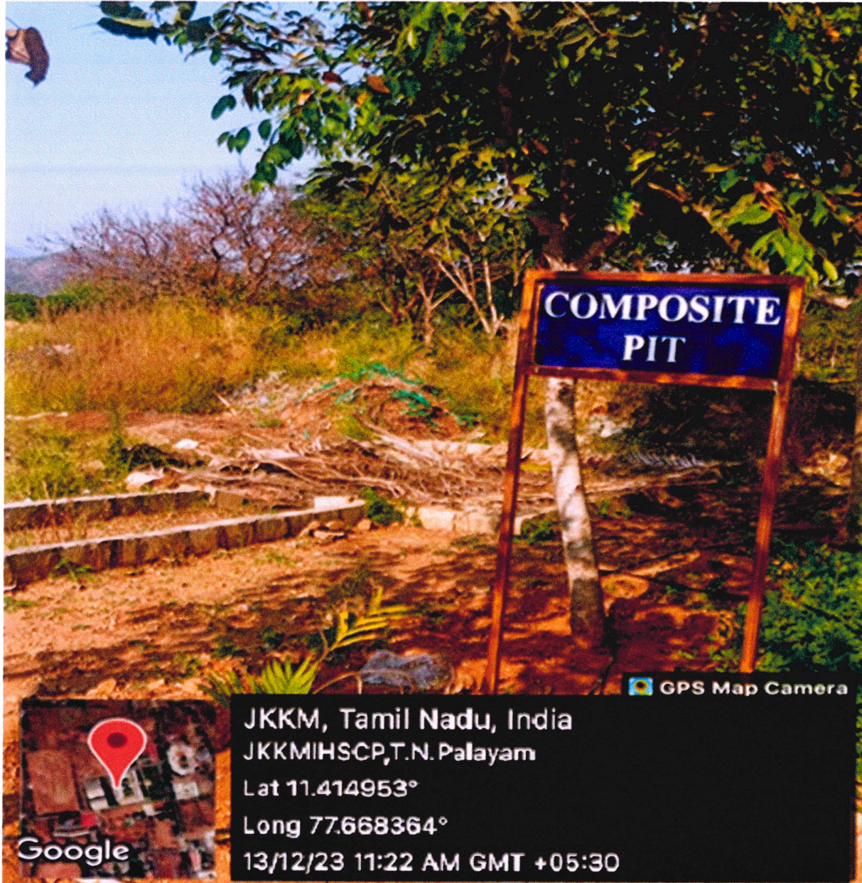
PHOTO OF COMPOSITE PIT IN SOLID WASTE MANAGEMENT

( Approved by Tamil Nadu Govt. & Pharmacy Council of India - New Delhi, Affiliated to The Tamil Nadu Dr. M.G.R Medical University, Chennai ) Thookanaickenpalayam, Gobichettipalayam (TK), Erode (DT) - 638506, Tamil Nadu.