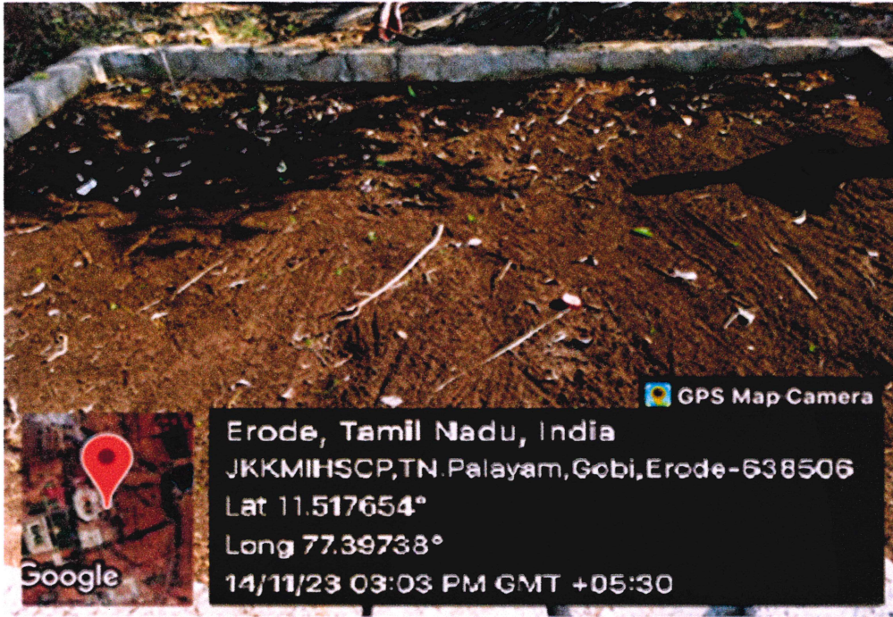
PHOTO OF AGRICULTURAL WASTE

( Approved by Tamil Nadu Govt. & Pharmacy Council of India - New Delhi, Affiliated to The Tamil Nadu Dr. M.G.R Medical University, Chennai ) Thookanaickenpalayam, Gobichettipalayam (TK), Erode (DT) - 638506, Tamil Nadu.