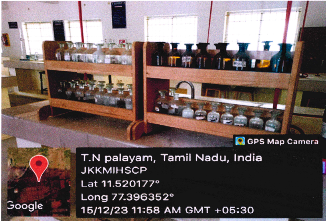
PHOTO OF HAZARDOUS CHEMICALS & RADIO ACTIVE MANAGEMENT

( Approved by Tamil Nadu Govt. & Pharmacy Council of India - New Delhi, Affiliated to The Tamil Nadu Dr. M.G.R Medical University, Chennai ) Thookanaickenpalayam, Gobichettipalayam (TK), Erode (DT) - 638506, Tamil Nadu.